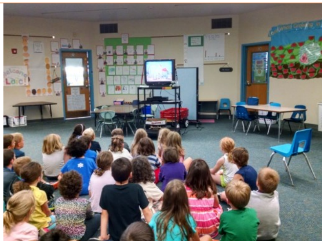
First graders participating in an Allergy Presentation given by the School Nurse